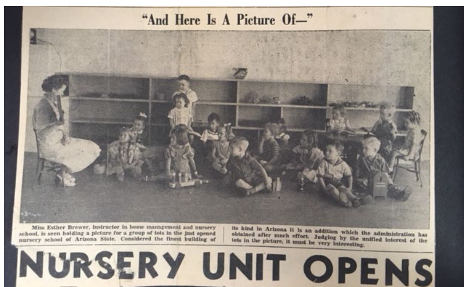
The newly completed Nursery School and Home Management House in 1942. The first Nursery School class.

The CDL is licensed to care for children from 1 year – 5 years of age and includes two multi-age pre-school classrooms and one young preschool/toddler classroom. Enrollment for toddlers under the age of 22 months is considered on an individual basis. The center reserves the right to make the final determination regarding the developmental appropriateness of an earlier enrollment.